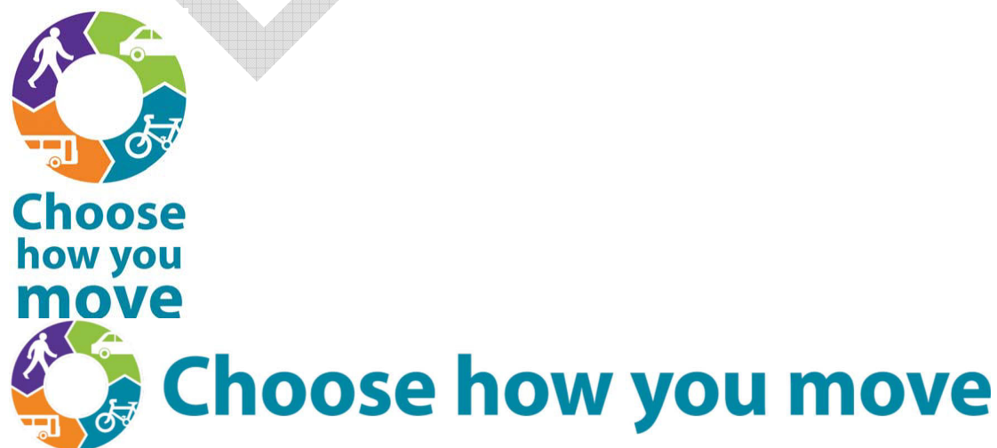
Figure A – Choose how you move branding

The 'Choose how you move' brand ( Figure A ) is central to the Destination Hereford project and our wider marketing campaign. We undertake market on the Destination Hereford project and this will inform the future delivery of marketing campaigns in the medium to long term.